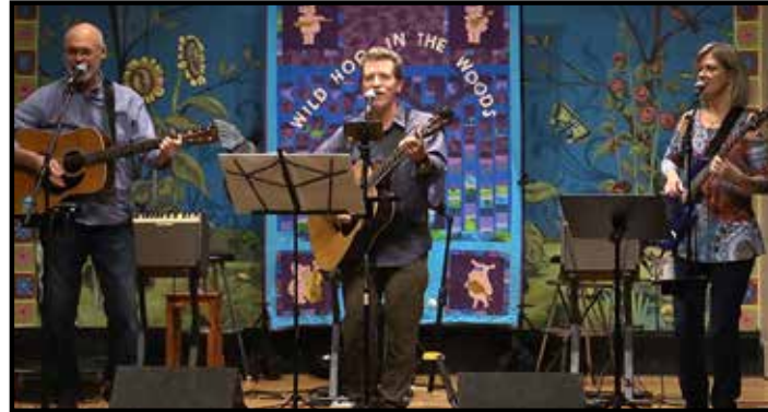
SATURDAY, JUNE 10 - 2:00 PM Bob's Your Uncle

Many of our BHFS patrons enjoy listening to concerts in the Mt. Morris Town Park (N3837 County RD G), so we are again extending concerts in the park through September! (inclement weather site: Mountain View Community Center). Tickets are only $10/person (18 and under FREE).